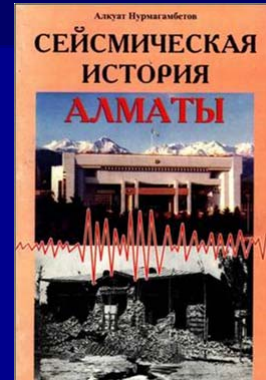
Almaty City Seismic History