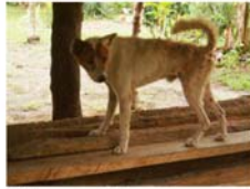
A dog named "Tsunami"