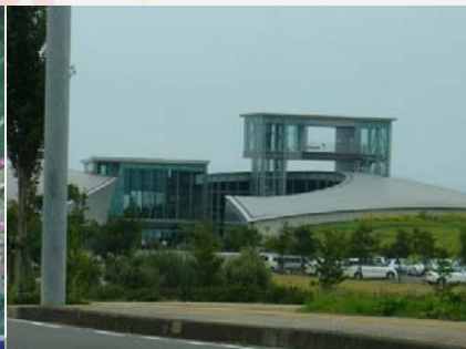
Geo-park をめざす平成新山フィールドミュージアム Mt. Unsen-Fugen Disaster Memorial Facility: Gamadas Dome