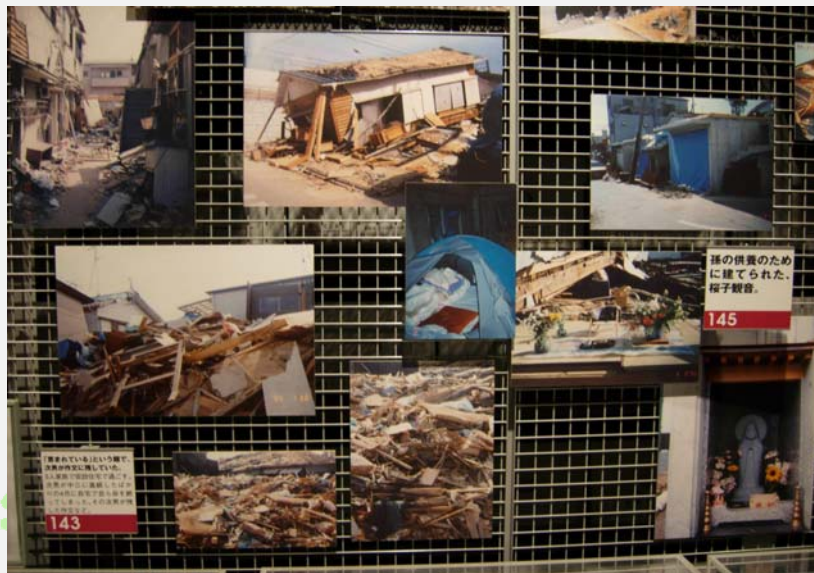
Exhibiting sadness, anger, regret etc. of those who took photos