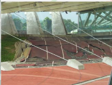
Preservation of fault on surface