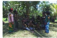
Memorial Song 2

1998 Tsunami claimed over 2,200 out of 12,000 local population -Victims attach their memory to important items: painting, dog named Tsunami, memorial canoe "LUS MANGI" (lost child), memorial songs, etc. -Legendary paddle taken over for 14 generations