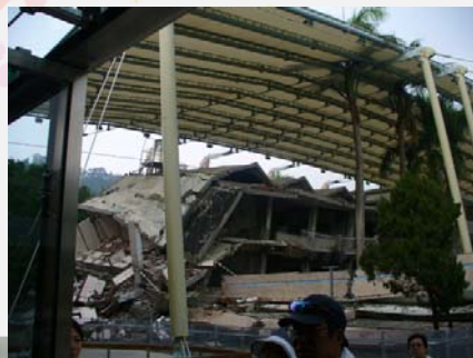
Preservation of collapsed school on site