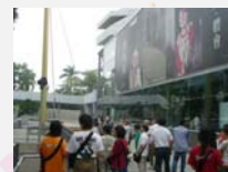
Shaking experience, AV record of quake