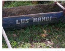
Memorial Canoe "Lus Mangi"