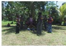
Memorial Song 1