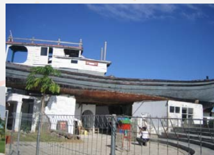
Boat stranded on roof top