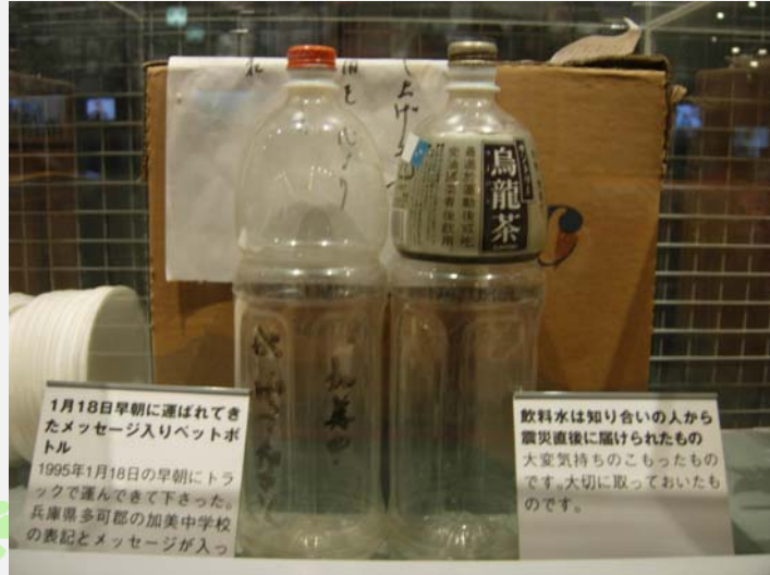
Exhibiting sense of gratitude to the person who kindly brought water bottles from far distance in the morning of the 2 nd day of the EQ