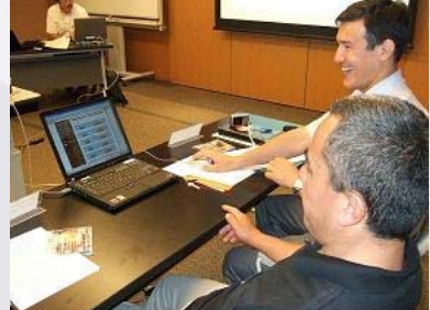
The participants practiced the "Disaster Management Audio Materials for Community Radio Broadcasting (DMAM)", developed by the lessons learnt from Great Hanshin-Awaji Earthquake