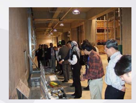
Observation of the storage for natural disasters