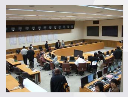
Visit to the Disaster Management Center of Hyogo prefectural Government