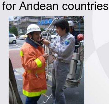
Participants experienced the emergency drill