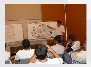
The participants made the hazard map and present it among themselves, after walking around a resident area of Kobe City.