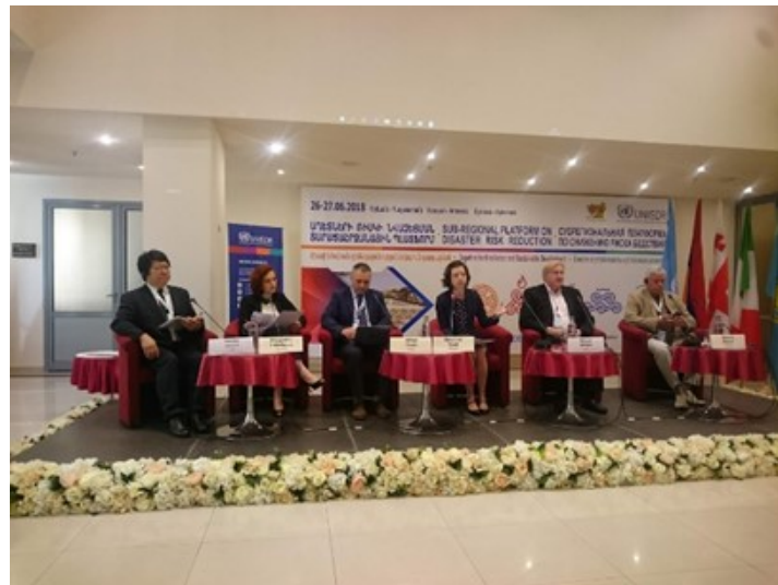
CASC Sub-Regional Platform on DRR

https://www.preventionweb.net/files/57668_finalyerevandclarationeng26.06.18.pdf