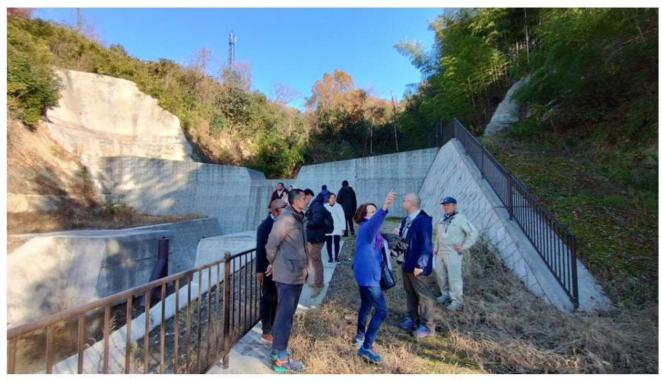
Lecture by the Tajimi Sabo National Highway Office and site-visit

ADRC would like to express its sincerest gratitude to all the organizations and universities that contributed to the success of the program.