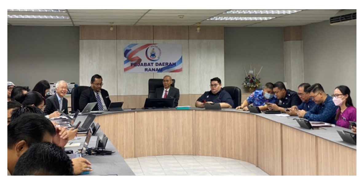
Review meeting with stakeholders

The meeting to report the outcomes of the project to the ASEAN member states will be held in February or March 2024. We also plan to discuss on the next project with the stakeholders.