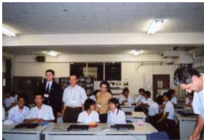
Figure 2: Dialog between students and foreign experts

This disaster mitigation education has just started and we don't have sufficient materials, nor a concrete approach to this type of education. Many teachers seem to be at a loss when carrying out disaster mitigation education. We published our results and information on the Maiko High School Web site to support teachers who are interested in or must offer disaster mitigation education but don't know how or what to do. Our task is to build a network for disaster mitigation education among schools.