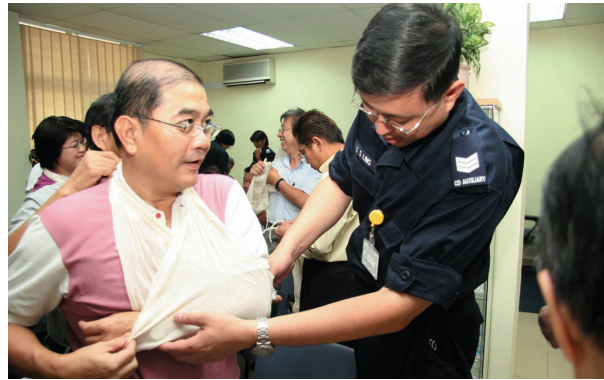
CEPP Training on First Aid

Force. Through this training programme, the SCDF will train intakes of about 25,000 SAF and SPF officers on an annual basis. The components of CEPP will be taught to these regular officers and national servicemen as part of their Basic Military Training at Basic Military Training Centre, Basic Police Training at Home Team Academy and on-going in-service training at various SAF and Police units. A total of 220,590 participants have benefited from this programme since it was launched on 22 September 2003.