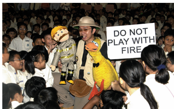
Fire Safety Puppet Show

9. The student population is also not neglected in the effort to prepare them for emergencies. Dedicated Liaison Officers from nearby fire stations are assigned to 177 primary schools to conduct awareness talks, support exhibitions and demonstrations, facilitate visits to fire stations, as well as assist in school emergency planning and exercises. As part of SCDF's collaboration with the NFPC in promoting fire safety education in schools, the Fire Safety Puppet Show for primary students and Fire Safety Drama for secondary students are held in addition to providing CD-ROM on fire safety and large-size picture story-book to be used during story-telling time at the school library. About 35,000 Secondary 3 students are also trained in CEPP every year. Since the introduction of the National Civil Defence Cadet Corp (NCDCC), 25 secondary schools have participated in the scheme. Students in uniformed groups such as the Boys' Brigade, St John's Ambulance Brigade, Red Cross etc are also taught emergency procedures.