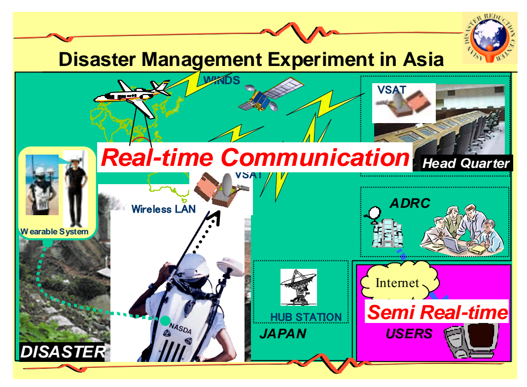
Fig.2-8-4 Disaster information system that utilizes Wideband InterNetworking engineering test and Demonstration Satellite (WINDS)

Moreover, it is examining, jointly with Japan Aerospace Exploration Agency (JAXA), National Institute of Information and Communications Technology (NICT) and Diamond Air Service (DAS), new early access to disaster information and means of sharing information which utilize, among others, Wideband InterNetworking engineering test and Demonstration Satellite (WINDS), a new communication satellite being planned to launch in 2007 by JAXA. (Fig. 2-6-4)