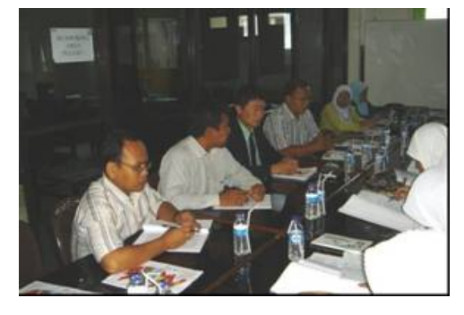
Fig. 4-1-4-4 Evaluation meeting

The relevant parties gathered to discuss the contents of the then-current version of the Teacher's Manual for Disaster Education. The manual was revised based on the results of this evaluation meeting, and at the end of FY 2007, the Teacher's Manual for Disaster Education has been designed to meet the specific needs of Banda Aceh and the schools there.