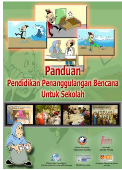
Fig. 4-1-4-5 Teacher's Manual for Disaster Education

Ensuring that each participant understands the importance of disaster preparation and creating communities where people support one another -- these are the bedrock upon which safety and security are built. The mission of disaster reduction education is to instill the concepts of "self-help" and "mutual help," and to cultivate self-motivated people who will take responsibility for creating 'a disaster-resilient society.'