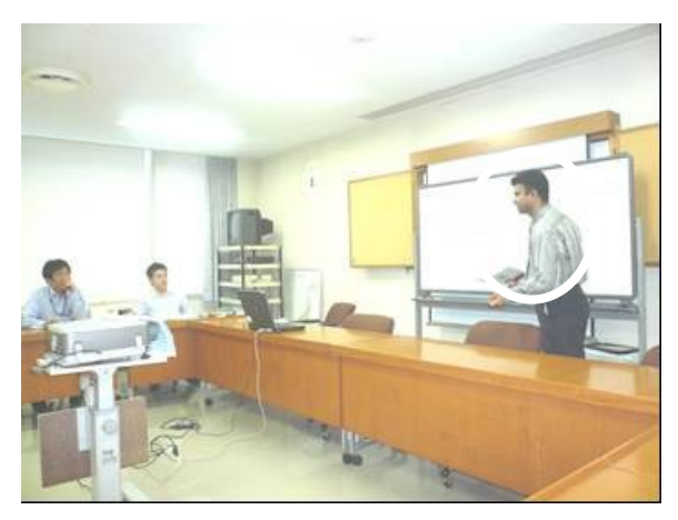
Fig. 4-1-1 Training at the Office of Climate Change, JICA Tokyo.