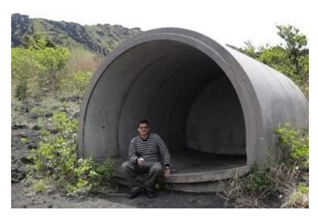
Fig.4-1-5 Volcano shelter in Izu on Oshima Island.