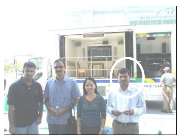
Fig. 4-1-4 Earthquake simulation vehicle (right).