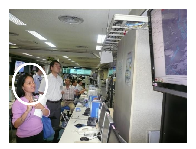
Fig. 4-1-3 Meteorological Agency, Tokyo.