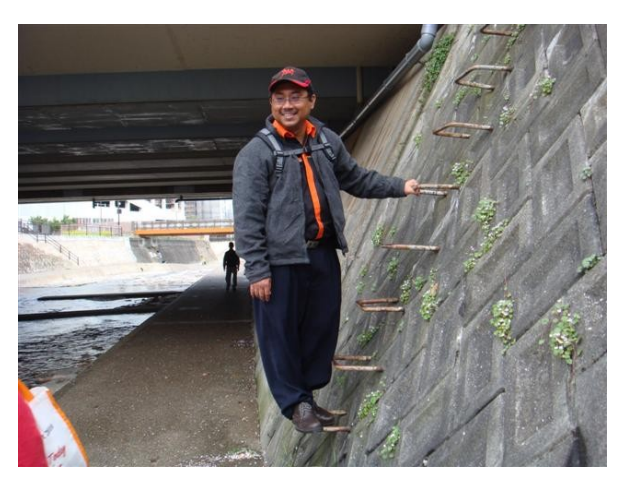
Fig. 4-1-7 Evacuation ladder along the Toga River, Kobe.