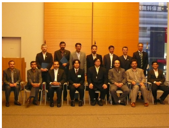
Fig. 4-2-4-2 Closing ceremony.