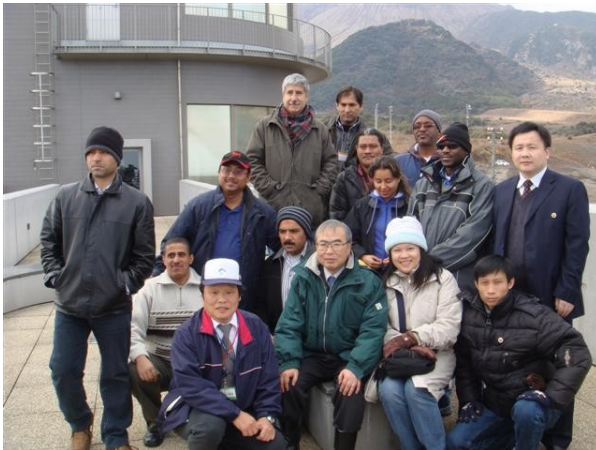
Fig. 3-1-3-1 Mt. Unzen-Fugen Memorial, Nagasaki.

ADRC plays an important role in sharing Japanese knowledge and experience with regard to disasters to help improve disaster prevention measures in the participants' home countries. Our mission is consistent with the goals of the United Nations, which has been promoting international disaster prevention cooperation since 1990.