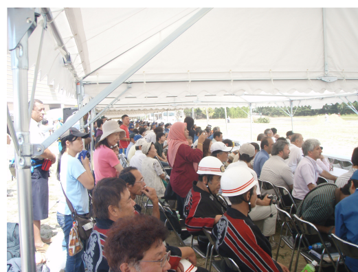
Fig. 4-2-2-2 Observation of Comprehensive Disaster Management Drills by Hyogo Prefecture