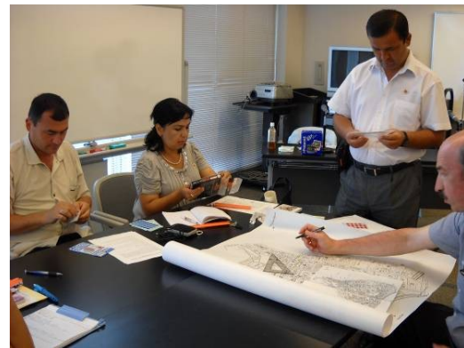
Fig. 2-2-5-2 Participants create a hazard map.