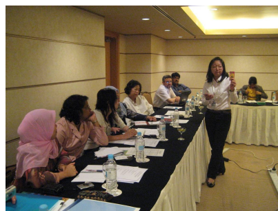
Fig. 4-2-1-1 A first year participant is introducing a tool.

The ADRC believe that this project could contribute to not only developing DRR capacity of ADRRN members, but to further strengthening the ADRRN network. Although this project finished in FY 2009, the ADRC would like to further promote disaster risk reduction in Asia in close cooperation with ADRRN members.