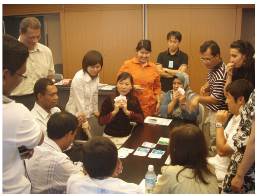
Fig. 4-2-2-1 Various Disaster Education Tools

They also visited disaster prevention education and dissemination facilities: Maiko High school and Fujitokoha University, and tried some tools including town watching and volcano eruption experiment using cocoa. These visits and experiences provided invaluable opportunities for the participants to see disaster prevention culture in various levels from school to public. The trainees were excited to utilize what they learned in Japan to contribute to the development of disaster education and public awareness in their respective countries.