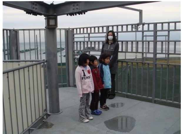
Fig. 3-1-3-2 Nursery school in Numazu.

Seventeen government disaster management officials from 13 countries (Bhutan, China, Costa Rica, El Salvador, Grenada, Haiti, Macedonia, Pakistan, Philippines, Thailand, Tonga, Uganda, and Vietnam) participated in this course and learned about Japan's disaster prevention systems.