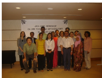
Fig. 4-2-1-2 Workshop participants