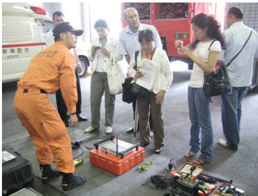
Fig. 2-2-5-1 A visit to a Tokyo Fire Station Training Center in Tachikawa

Since 2007, our trainings have included a workshop for developing action plans using the Project Cycle Management (PCM) method. Over the course of four days, trainees learned the basics of PCM as well as how to put what they had learned into practice. The trainees were able to achieve the objectives of the workshop, and are expected to become leaders who can apply what they learned here to various disaster reduction projects in their own countries.