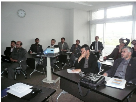
Fig. 4-2-4-1 Lecture at Shimizu cooperation.

Participants attended presentations given by the Takenaka Corporation and Shimizu Corporation. They were able to learn about the latest methods of retrofitting buildings, residences, and school buildings. They then visited the Hyogo Earthquake Engineering Research Center and the Kobe Ports and Harbors Office. At these facilities, they learned about the countermeasures taken by the Port of Kobe in response to earthquakes and tsunamis.