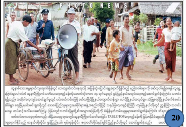
တတိယအကြိမ် ဆူနာမီသတိပေးနံရိုးဆော်ချက်ကြောင့် ကျေးရွာနေ ဖြည့်သူများ Cyclone Shelter သို့ စိုလှုံရန်မြေးလွှားနေရန်