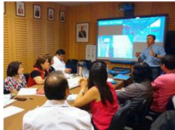
Knowledge sharing at the hospital of an ex-participant