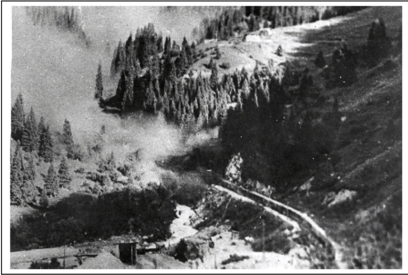
Figure 3. Disastrous debris flow on the Malaya Almatinka River (1973).