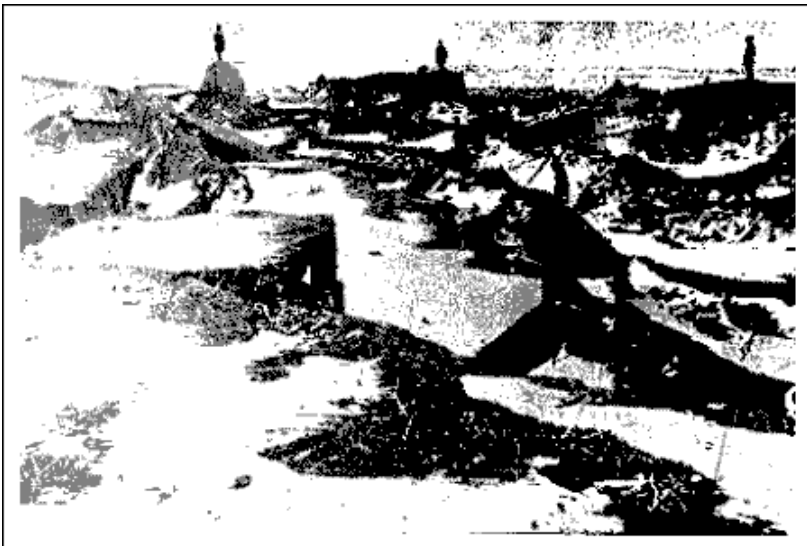
Figure 2. Ruptures of the earth surface formed during Kemin earthquake (1911).

1. Almaty Oblisy, 2. Alcmola Oblisy, 3. Aktobe Oblisy, 4. Atyrau Oblisy, 5. West Kazakhstan Oblisy (Oral), 6. Manghystau Oblisy (Aktau), 7. South Kazakhstan Oblisy (Shymkent), 8. Paviodar Oblisy, 9. Karaghandy Oblisy, 10. Kostanai Oblisy, 11. Kyzylorda Oblisy, 12. East Kazakhstan Oblisy (Oskemen); 13. North Kazakhstan Oblisy (Petropavlovsk), 14. Zhambyl Oblisy (Taraz)