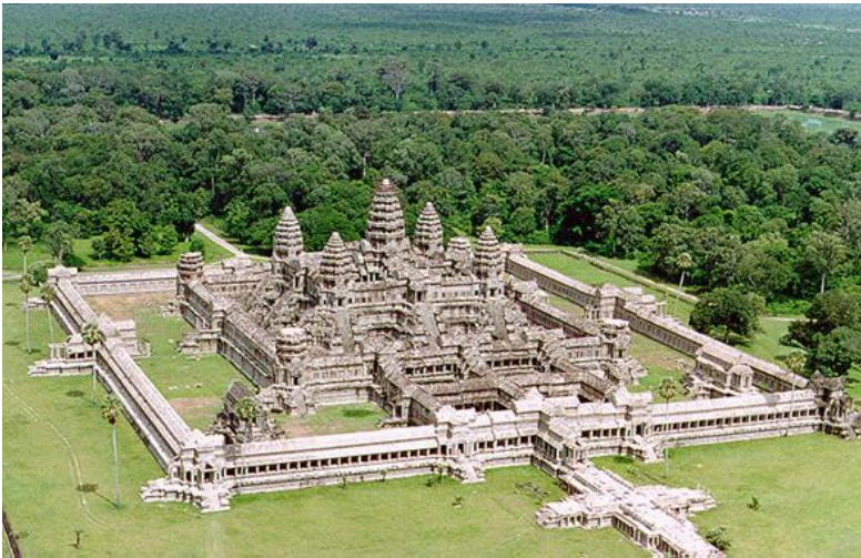
Map of extent of the flood 2000 and 2001