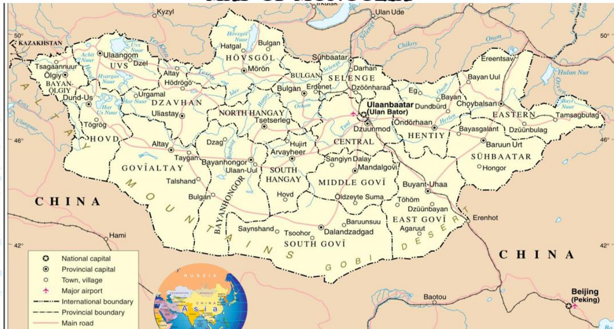
Figure 1. Map of Mongolia