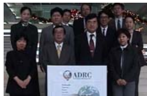
ADRC Staff Members

in a multidisciplinary way. Countries in Asia have the wealth of experiences and know-hows in disaster reduction. We, ADRC would like to contribute to disaster reduction through linking and amalgamating these expertise and providing needed information and services. Therefore, we would like to ask you assistance and cooperation in our pursuit.