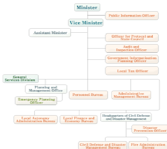
Fig. 1 Organization Structure

The Ministry of Government Administration and Home Affairs (MOGAHA) is the administrative arm of the central government. MOGAHA was created on February 28, 1998 through the integration of the Ministry of Government Administration and the Ministry of Home Affairs. The major functions of the Ministry of Government Administration and Home Affairs are follows: to provide general services for the government, to manage organizations and personnel administration, to foster local administration, and to protect lives and property from disasters. More specifically for the fourth function, MOGAHA render service for preventing and controlling man-made and natural disasters, and for improving fire prevention and emergency rescues services.