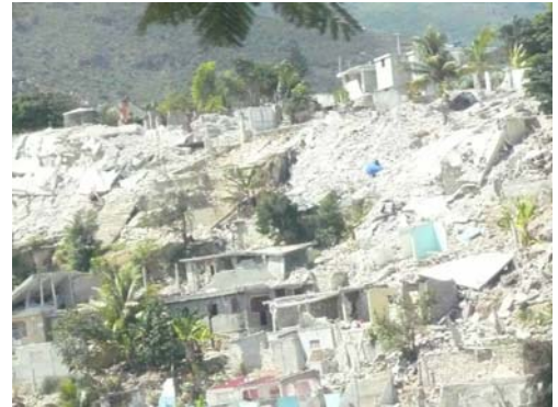
[Collapsed houses in suburban Port-au-Prince]

Haiti will require continued assistance for many years to come, and faces challenges that must be met not by Haiti alone but by the international community as a whole. The government expects reconstruction and recovery to be achieved in 10 years. ADRC would like to continue to explore ways to provide support to Haiti through the framework of the International Recovery Platform (IRP) as well as to share Haiti's experiences with the countries of Asia.