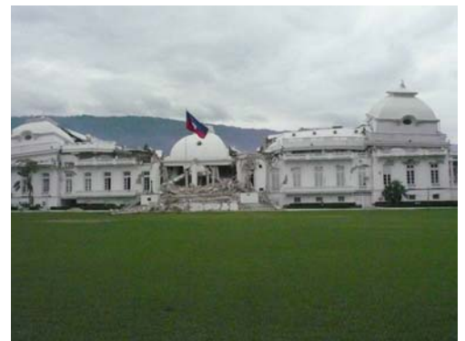
[Presidential Palace] (the second story collapsed)

The Port-au-Prince metropolitan area is home to approx. 2.5 million people, one quarter of the national population. In the center of the capital, almost all government buildings, including the Presidential Palace, Parliament and Ministries were completely destroyed, resulting in the deaths of many government officials. As a result, government functions were paralyzed, hampering immediate response and early recovery work. Economic and social activities were also greatly affected. Since the country's economic and administrative center was severely damaged, the earthquake affected almost every part of Haiti. This is what makes the Haiti earthquake distinct from many other disasters.