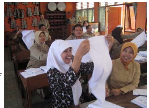
[First Aid Training: Training of Teachers]

As the first step of the project, ADRC and MONE jointly organized a Training of Trainers (TOT) for teachers of schools in Yogyakarta on 1-2 March 2010. More than 50 primary school teachers attended this two-day event. Among the topics discussed by the Japanese experts were the “Current State of Disaster Education in Japan,” “Earthquake Disaster Risk Reduction in Japan,” and “Basic Knowledge of Natural Disasters.” With regard to experiences in Yogyakarta, a report was given indicating that there have been many earthquakes in this province in the past, including the latest one in 2006 which claimed more than 5,000 lives. In view of the risks