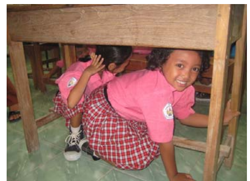
[Evacuation Drill: Pilot Class]