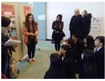
Poster session during the Miyagi Junior Leader Training Program

The participants, who were selected based on the results of an online training test conducted by MoNE before the JICA course, as well as on their passion for promoting DRR education, were very actively engaged in the training course. The Deputy Minister of MoNE just happened to be visiting Japan for another purpose at the same time, and joined portions of the training program, including the final presentation of action plans proposed by the participants. The Deputy Minister was deeply impressed by the participants' eager engagement, and gained many ideas for expanding and further strengthening school DRR education in Turkey. It is hoped that all 34 participants, including those that attended the September 2019 course, will become leaders for promoting school DRR education in Turkey. It is hoped that they will make good use of the knowledge, technologies, and methods they learned from these training courses, and will be able to take advantage of the network of personal contacts they established by participating in the courses.