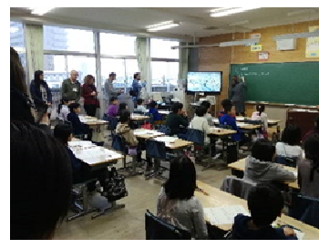
Observing lessons at Takasago elementary school