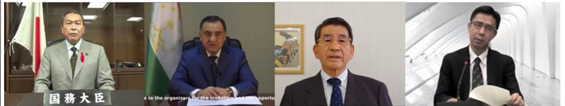
20 October: Opening Ceremony and Special Presentation

The Asian Conference on Disaster Reduction (ACDR) 2020 was held for the first time in an online format on 20-22 October 2020. An annually organized event, ACDR aims to promote the sharing of information and practices for implementing SFDRR and the SDGs, and to further enhance partnerships among ADRC member countries and various international and regional DRR organizations. ACDR2020 was organized jointly by the government of Japan and ADRC. The virtual ACDR2020 was attended by 244 people from 22 member countries, representing DRR organizations, research institutes, universities, and the private sector. The agenda consisted of an opening ceremony, special presentation, keynote speeches, and two thematic sessions.