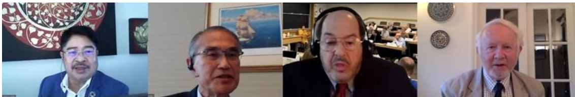
20 October: Keynote Speeches

The next issue of ADRC Highlights features articles on Session 1 and Session 2 held on 21 and 22 October 2020.