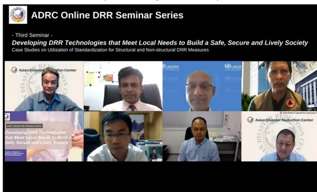
Speakers of the Third ADRC Online DRR Seminar