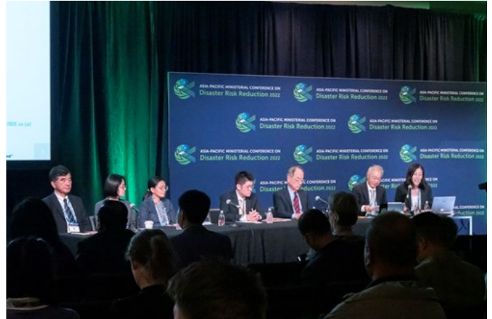
ADRC’s partner event

In addition, ADRC displayed two posters as a member of the “All Japan Bosai Team” in the Conference Marketplace. ADRC introduced participants to its recent