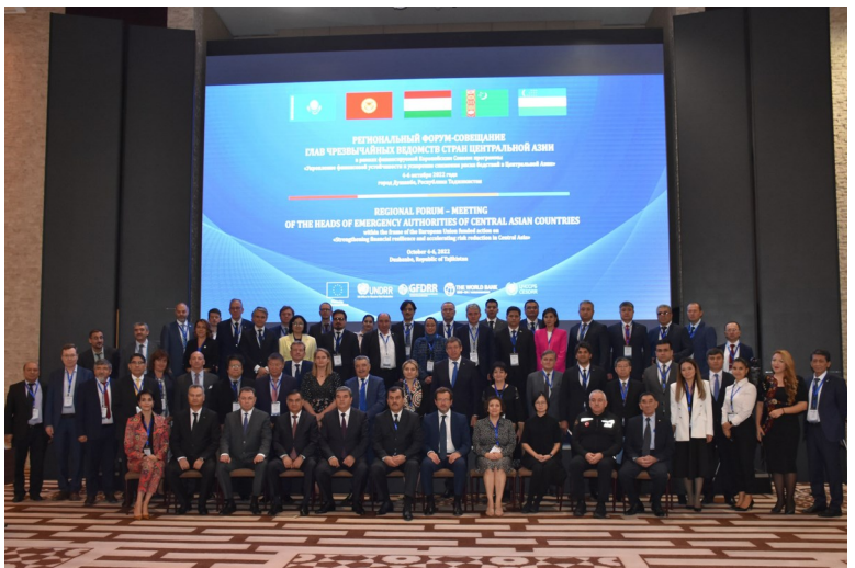
The Regional Forum of the Central Asian Countries

ADRC introduced current activities that contribute to capacity building in the Central Asian countries, such as the visiting researcher program, the Sentinel Asia project, GLIDE, and preparations for a future Asian Conference on Disaster Reduction (ACDR) in Tajikistan.