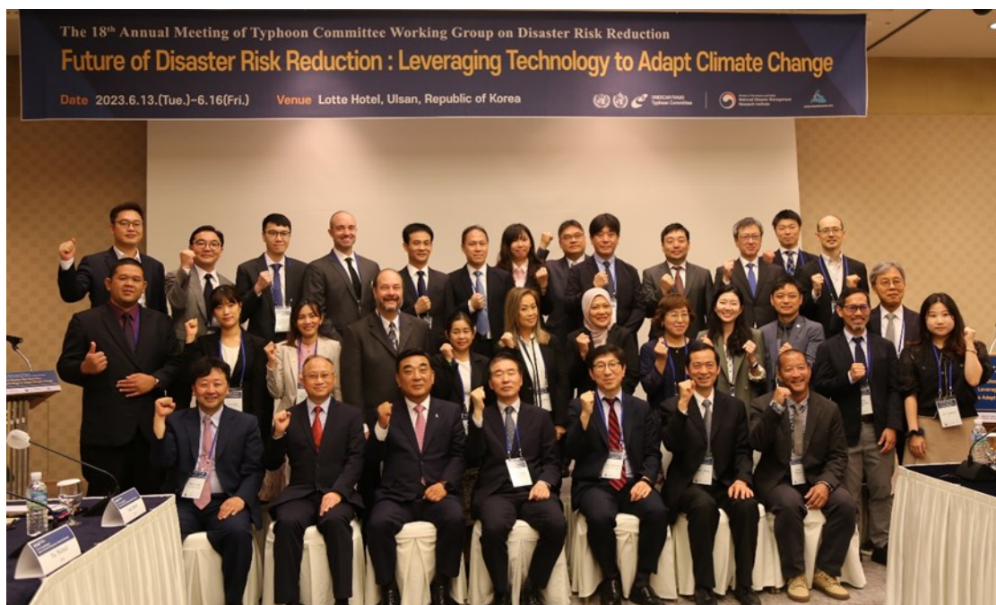
Participants with the Vice Minister of MOIS and Mayor of the Ulsan

One of the recommendations brought up by this meeting was to explore the linkage between the Typhoon Committee’s Disaster Information System (TC-DIS) and the ADRC’s GLObal Unique Disaster IDentifier number (GLIDE) system. Under this proposed linkage, ADRC may be requested to provide an orientation to the 14 TC/WGDRR member countries on how to input the disaster information to the GLIDE system, focusing on tropical cyclone, storm surge, flood, and landslide. The progress of this potential linkage will be reported at the 18th Integrated Workshops (18th IWS) of the Typhoon Committee to be held on 27-30 November 2023 in Bangkok, Thailand.