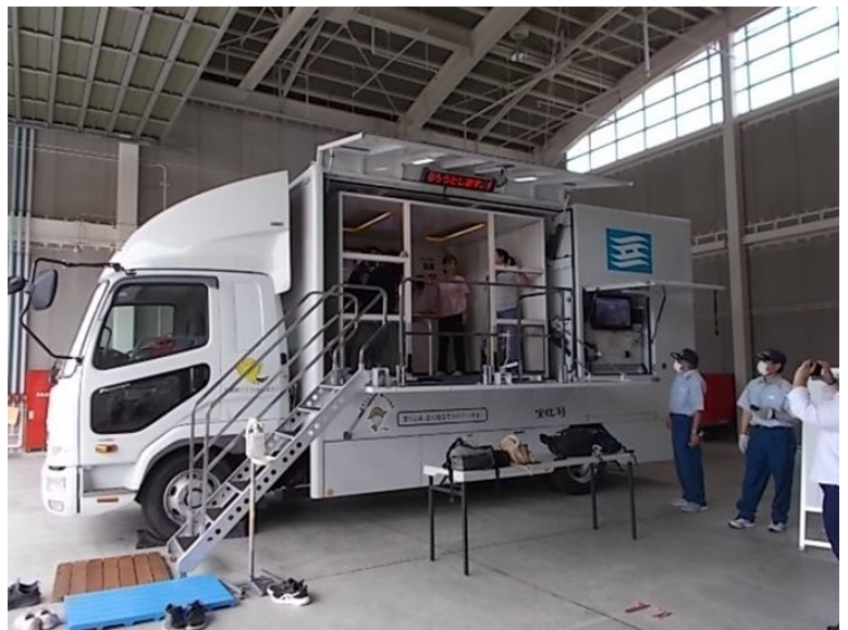
Earthquake Simulation Vehicle at Hyogo Prefectural Emergency Management and Training Center

ADRC would like to express its sincerest gratitude to all the organizations and universities that contributed to the success of this course.