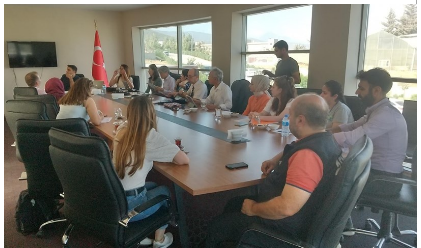
Workshop (Hatay Province)

The delegation visited schools that were