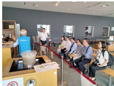
(Left) DRM Training at Kyoto City Disaster Prevention Center, (Right) Workshop at DRI