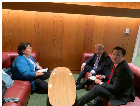
Meeting with NEMA Mongolia