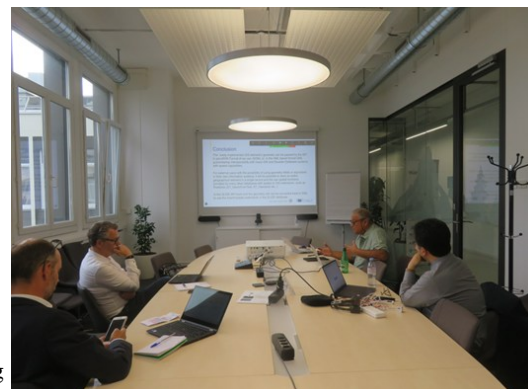
GLIDE Joint Subcommittee Meeting

The GLIDE Joint Subcommittee Meeting was held on 4 June 2025 in Geneva, Switzerland. The GLIDE Steering Committee has three Subcommittees: API, New Product Developments, and SOPs, and the purpose of this meeting was for these committees to jointly discuss the future development of tools. In a hybrid format, nine members gathered for a technical discussion on benefits and challenges regarding GLIDE's collaboration with other institutions. The participants agreed to meet and work together toward the completion of the tools at the 11 June Steering Committee meeting and periodically in the future.