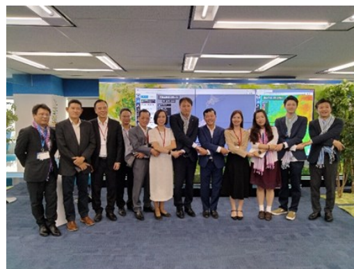
Visit to WeatherNews Inc.

On 25-29 May 2025, a delegation from Asian Disaster Reduction Center (ADRC) counterpart the Vietnam Disaster and Dyke Management Authority (VDDMA) visited Japan to learn about Japan's disaster risk reduction (DRR) efforts through a five-day programme. The delegation consisted of five senior officials and one private sector representative. At the request of VDDMA, the ADRC provided advice on the overall programme design, coordinated visits to various organisations, and accompanied the delegation throughout the visit.