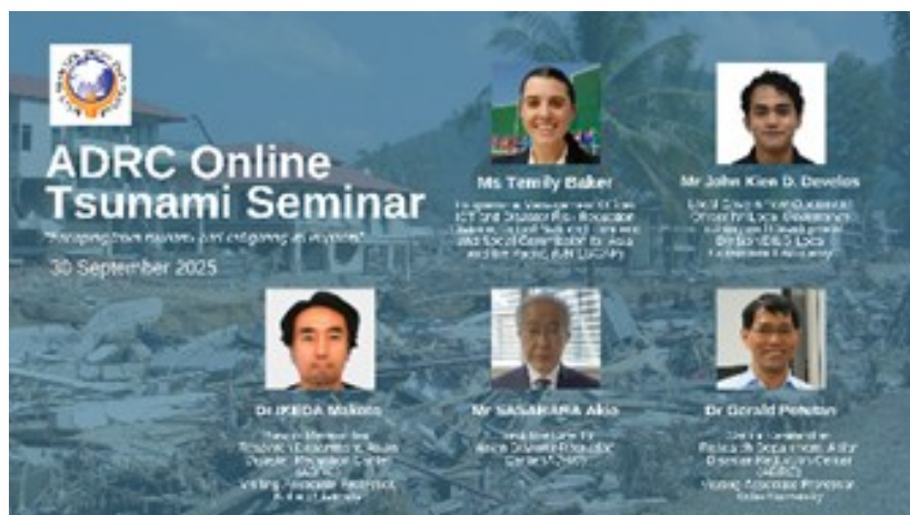
ADRC Online Tsunami Seminar 2025