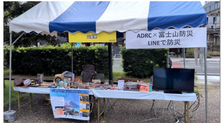
ADRC's exhibition booth

By presenting the system in Yamanashi, the initiative highlighted how everyday digital tools can help communities prepare for disasters, linking advanced technology with local participation.