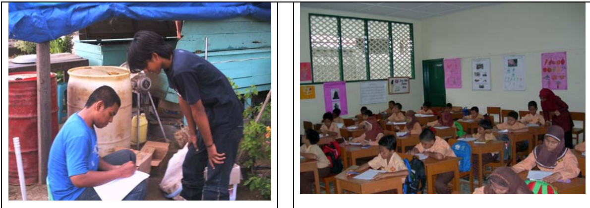
Interview with resident in Samatiga sub-district and student filled in the questionnaire form in Johan Pahlawan sub-district

The location of survey is in Aceh Barat and Aceh Jaya district that affected by tsunami. The study area is consisting in 9 sub-districts covering the whole affected area in Aceh Barat and Aceh Jaya. The study team consists of 13 surveyors for interviewing residents, 15 surveyors for elementary school students, 12 surveyors for elementary school teachers and 15 surveyors for interviewing government officers. The process of survey is starting by identifying the location of survey and the number of samples in each location and then followed by sending the surveyor to their locations and directly interview the respondents one by one.