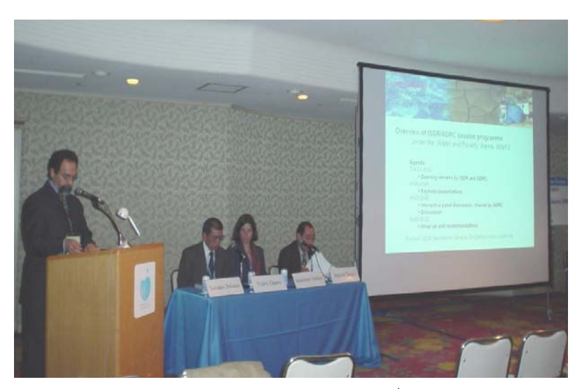
Fig. 4-1-2-3 ADRC-ISDR session in the 3<sup>rd</sup> World Water Forum