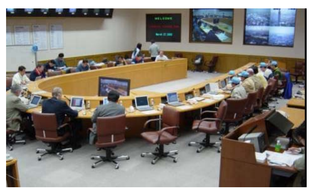
Fig. 4-2-1-1 UNDAC simulation training

A total of 31 trainees participated in the course from 14 national governments and 8 international organizations in the Asia-pacific region. The training course provided the participants with information about the UNDAC methodology, the UN Humanitarian systems and personal skills required to undertake actual missions and was facilitated by the traininers specialized in disaster management and OCHA staff.