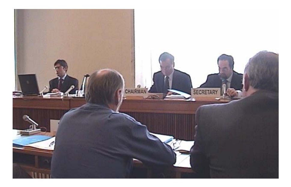
Fig. 4-1-2-1 ISDR Task Force 5<sup>th</sup> meeting