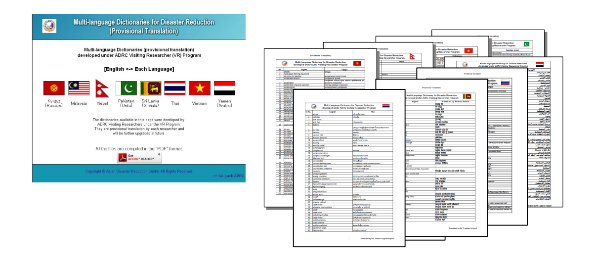
Fig.3-2-2-2 Multi-language Dictionaries for Disaster Reduction (Provisional Translation)

Side by side translation lists have already been completed by researchers from Kyrgyz (Kyrgyz and Russian), Malaysia, Nepal, Pakistan, Sri Lanka, Thailand, Vietnam, and Yemen (Arabic) by March 2013, and been offered in the format of "Multilingual Dictionaries (Tentative)" on the ADRC website separate from the "Multi-language Glossary,". They were intended to serve as reference materials for disaster reduction activities in member countries.