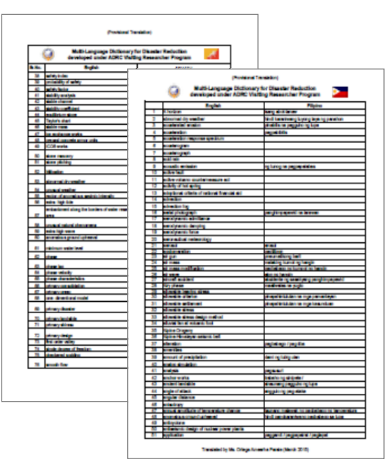
Fig.3-2-2-1 Multi-language Dictionaries for Disaster Reduction (Provisional Translation)