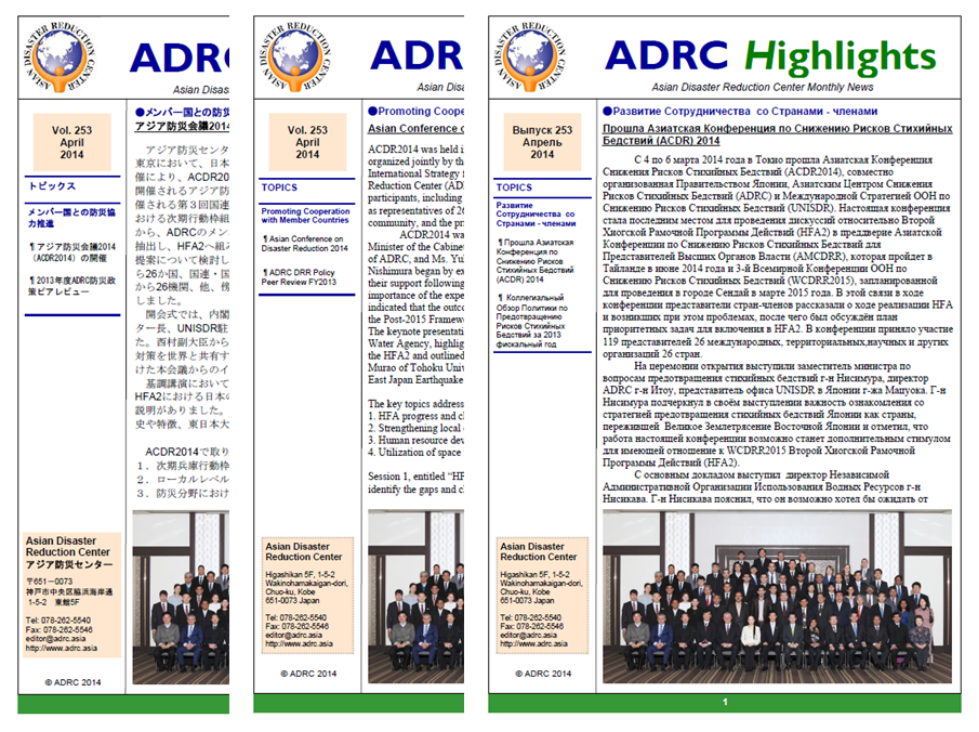
Fig. 3-2-3-1 ADRC Highlights

ADRC has been using the Internet and e-mail to share information with its counterparts in the member countries, and other applicants. As one of its mainstay tools for information dissemination, ADRC has been issuing the newsletter "ADRC Highlights" since 1 June 1999. It had been issued twice a month until FY 2007, and has been issued once a month since the renewal of its design in FY 2008.