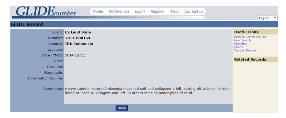
Figure 3-2-1-2 GLIDE Number of the disaster (1)