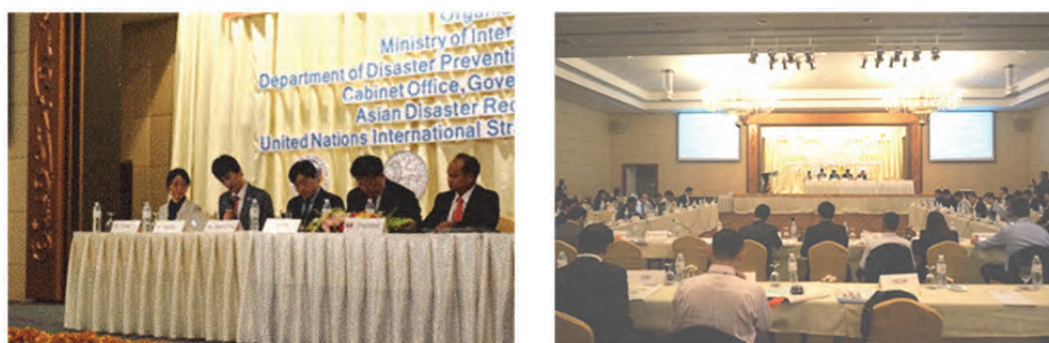
Fig.5-3-4 Special Session on the White Paper in the ACDR2016

In the special session titled “DRR Policy Reporting for Better Governance,” the participants had an exchange of their knowledge, experiences, and views on DRR policy reporting and information sharing of the DRR activities in their own countries. Also, the summary version of the “2015 White Paper on Disaster Management in Japan” was distributed to each participant.