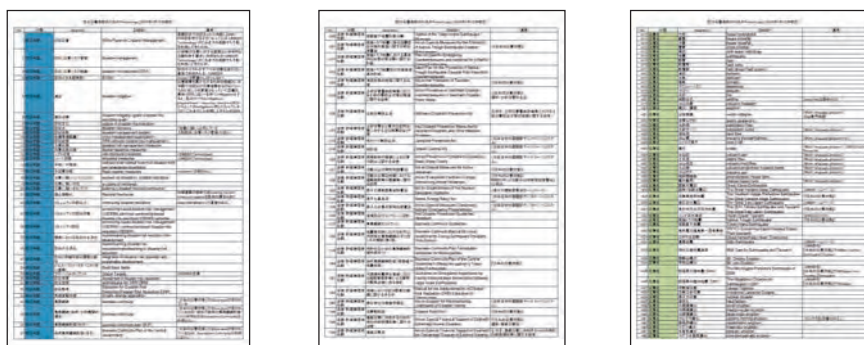
Fig. 5-3-1 Japanese-English Terminology on DRR

A Japanese-English terminology for the words and terms frequently used in the "2015 White Paper on Disaster Management in Japan" was developed.