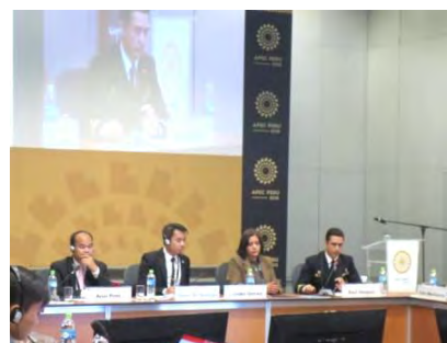
Fig. 2-2-2 Photo on Conference