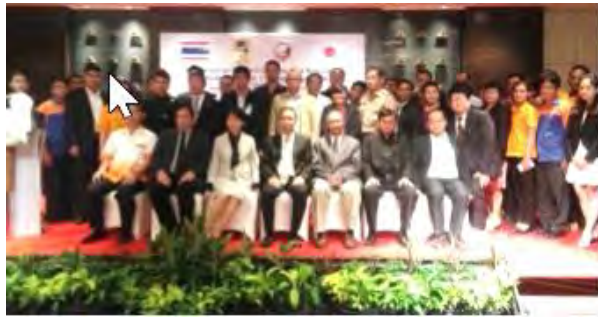
Fig.2-2-3 Tsunami DRR Workshop participants in Krabi