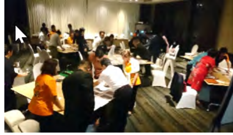
Fig.2-2-4 DIG Activity

A wide range of lessons could be drawn and shared with from the discussion of the one day workshop attended by locally based governmental sector, private sector, and civil sector in tsunami vulnerable areas. Amongst all, experiences as famous coastal resort areas affected by a mega disaster are useful for and to be applied to many other tourist destination areas.