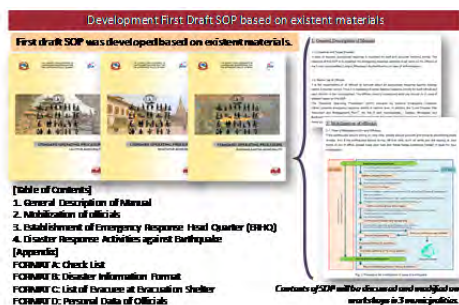
Fig. 5-2-1 First Version of the SOP for Municipalities

In the fiscal year 2016, as one of the activities on “Standard Operation Procedure (SOP) Planning”, the existing SOPs in Nepal were reviewed. Then, using the result of the chronological survey on the emergency response activities of the disaster management organizations at national level and in the pilot municipalities in the case of the Gorkha Earthquake, the first version of the SOP for municipality level was drafted. Also, as the activities on the “Community Based Disaster Risk Management(CBDRRM)”, a 3-day CBDRRM training for the municipality officers in pilot areas was organized. After the training, pilot activities for the CBDRRM in the pilot communities were discussed and coordinated among the stakeholders.