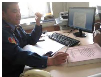
Fig. 5-2-5 Interview Survey in Emergency Management Department in UB City (EMDC)

(Source: JICA Data Collection Survey of Disaster Protection and Prevention in Mongolia)