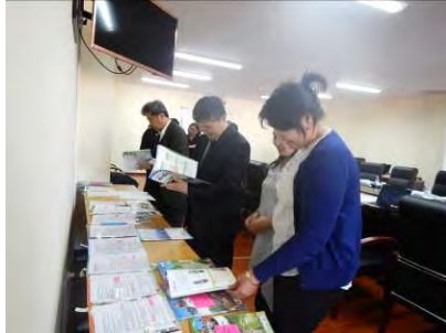
Fig. 5-2-6 Introduction of DRR-related Contents in Japanese School Texts

Mongolia was initiated. Further, the training program for the project counterpart persons was organized in Japan in March 2017 for learning Japan's DRR efforts, including School DRR education.