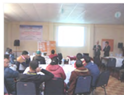
Fig. 5-2-2 CBDRRM Training for Municipality Officers