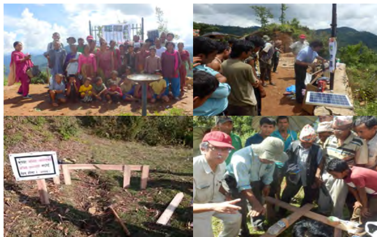
Fig. 5-2-3.DRR workshop at local community

Landslides are one of the most familiar natural disaster in Nepal, because many Nepali live at slope areas with terraced field. It means Nepali people are living with risk of landslides. However, there are no Landslide EWS in Nepal. Therefore, to protect lives at high risk communities, community awareness and community based disaster risk reduction are necessary. JICA project team held a DRR seminar at Kerabari village, Syaule, Sindhupalchok in collaboration with Department of Water Induced Disaster Prevention: DWIDP, with participation of more than 50 villagers including the village leader and school teacher. Kerabari villagers have lost some friends and families caused by a big landslide at the Nepal earthquake on 25 th April 2015.