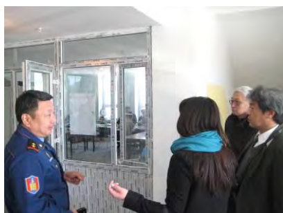
Fig. 5-2-4 Observation Visit to the Public DRR Training Center under Construction

ADRC dispatched the expert on “DRR Education” in this survey to review and analyze current situation and issues to be addressed in the field of DRR education in Mongolia. Also, based on the survey result, priority activities to be conducted in the next project were proposed.