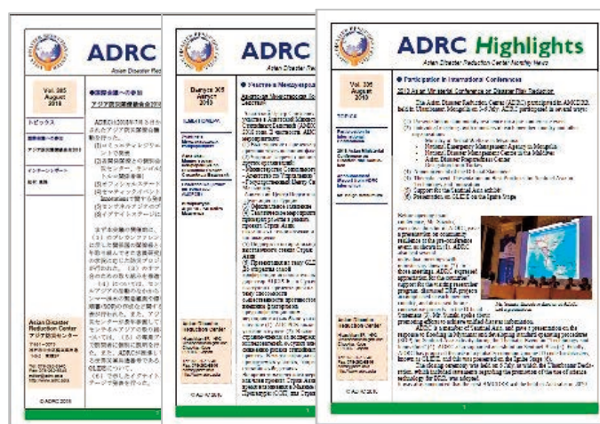
Fig. 3-2-5 ADRC Highlights (August 2018: Japanese edition, English edition, Russian edition)

ADRC has been using Internet and e-mail to share information with its counterparts in the member countries, and other relevant parties. As one of its important tools for information dissemination, ADRC has been issuing the newsletter “ADRC Highlights” since 1 June 1999. It had been issued twice a month until FY 2007, and has been issued once a month since the renewal of its design in FY 2008.