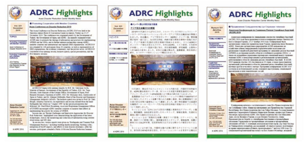
Fig. 3-2-2-1 ADRC Highlights (December 2019: English edition, Japanese edition, Russian edition)

ADRC has been using Internet and e-mail to share information with its counterparts in the member countries, and other relevant parties. As one of its important tools for information dissemination, ADRC has been issuing the newsletter "ADRC Highlights" since 1 June 1999. It had been issued twice a month until FY 2007, and has been issued once a month since the renewal of its design in FY 2008.