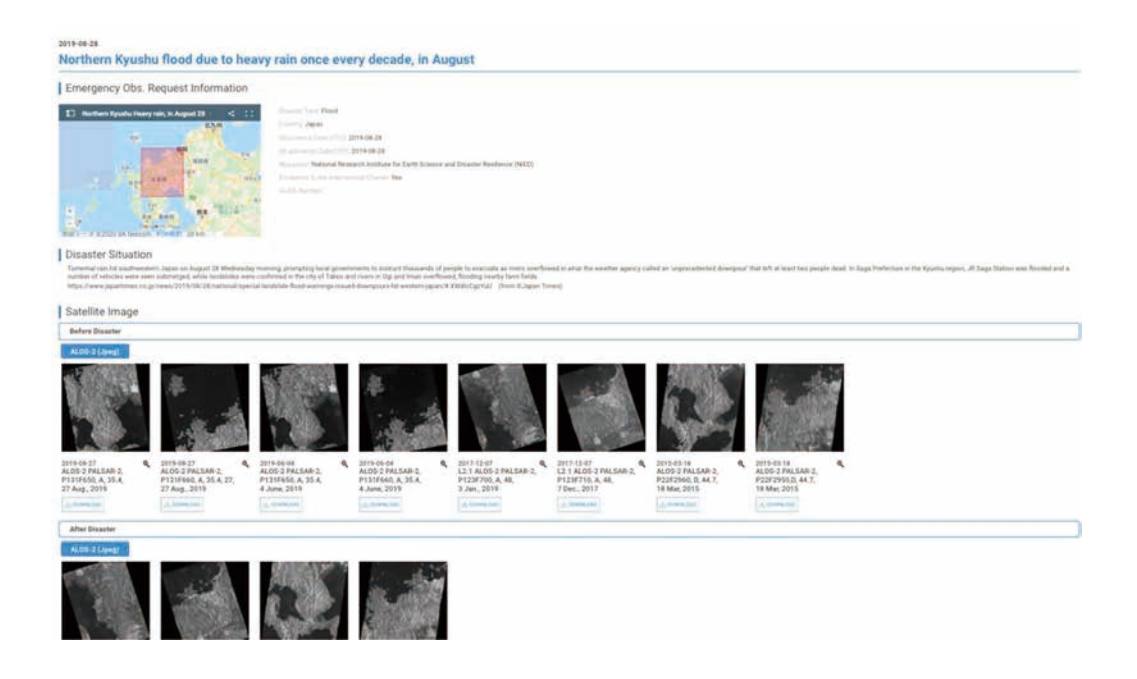
Fig. 3-2-1-6 Emergency observation by Sentinel Asia

Since FY2007, the website has been linked to JAXA's Disaster Management Support System, giving further value added information, namely satellite imageries of the affected areas (Fig. 3-2-1-6). As of 29 February 2020, a total of 2,372 disasters have been registered in the database.