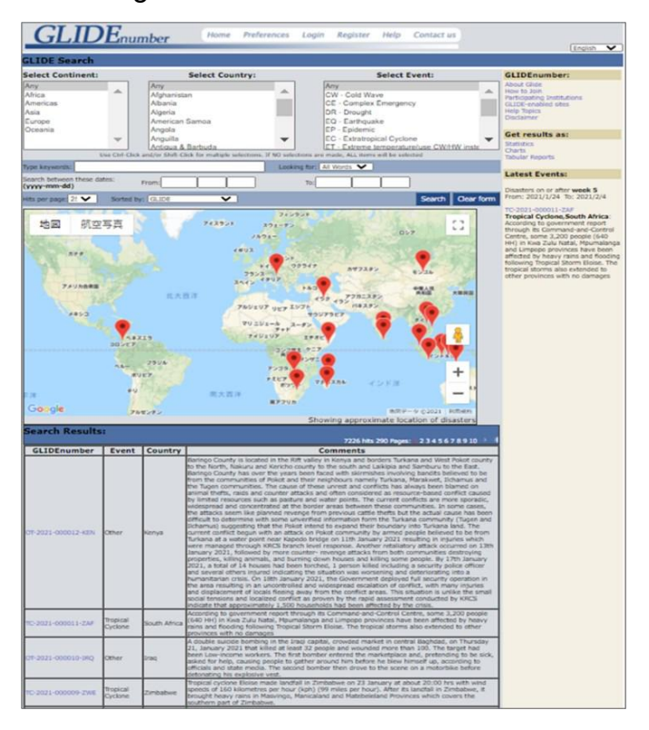
Figure 3.10. GLIDE Information

As mentioned in section 2.4, GLIDE is a disaster identifier system that is commonly formatted but has unique numbers assigned to every disaster. ADRC disseminates detailed information about disaster through GLIDE.