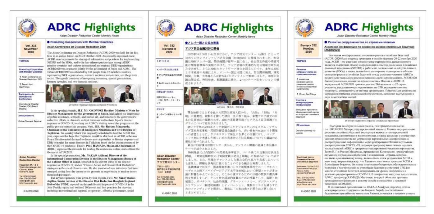
Figure 3.9. ADRC Highlights November 2020 Edition

ADRC Highlights (published in English, Russian, and Japanese) is uploaded on the website, and its text version is distributed by email to the list of subscribers comprising: ADRC counterparts, former visiting researchers, former GLIDE visiting researchers, participants in the past ADRC annual meetings, visitors to ADRC, trainees in JICA's training courses which ADRC conducted, and participants in international conferences which ADRC took part. ADRC also registers e-mail addresses of those who wish to subscribe the newsletter upon the receipt of request e-mail. ADRC has been updating its mailing lists in order to deliver the newsletter more effectively and efficiently to readers.