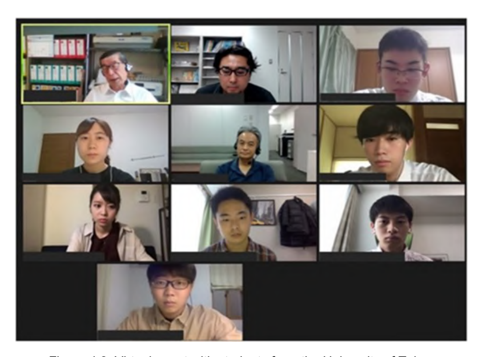
Figure 4.8. Virtual event with students from the University of Tokyo

Few online short training activities were also conducted in FY 2020. On 2 September 2020, ADRC and the University of Tokyo virtually organized a sharing experiences on improving disaster education (Figure 4.8). Outcome of this activity included the expression of mutual interest in conducting a localized programme based on the opinions of residents (e.g., organizing evacuation drills for students, teachers, and community).