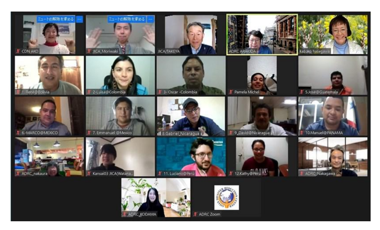
Figure 4.6. CDRR for Central and South America

Another comprehensive disaster risk reduction (CDRR) course was conducted for participants in Central and South America held on 29 January 2021 to 26 February 2021. A total of 12 officials from 8 countries participated in this course, where sessions were conducted online – early morning in Japan and evening in Latin American countries. One of the key topics covered was the development of effective Disaster Risk Reduction Strategies (DRR Strategies). The process included watching pre-recorded video materials, discussions, and experience sharing.