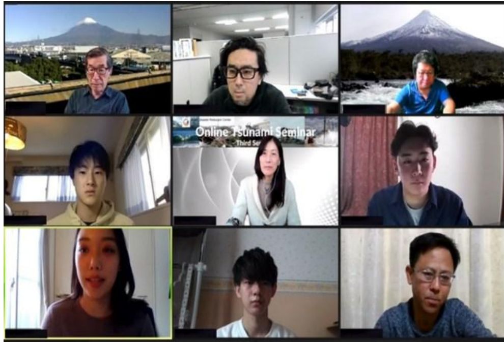
Figure 4.9. Virtual Event with Students from Hosei University

In addition, on 27 January 2021, ADRC virtually organized an experience sharing activity with students from Hosei University. In this event, ADRC shared lessons on promoting seismic-resistant houses and buildings in Indonesia as well as the importance of “town watching” as practical tool to enhance community resilience to disasters (Figure 4.9).