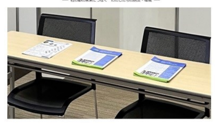
Figure 6.3 IRP Display Booth at the Sendai Forum 2022