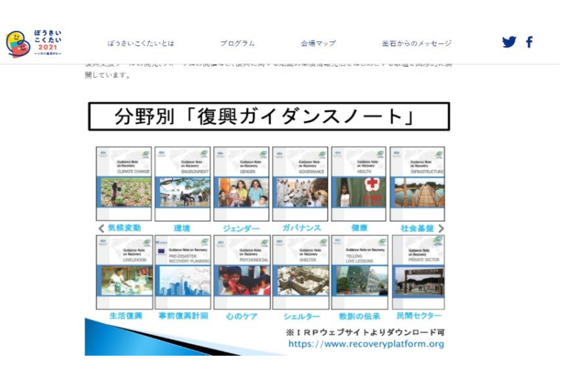
Figure 6.2 Online display of IRP Guidance Notes on Recovery

On 5-6 November 2021, IRP 6th participated in the National the Promotion of Convention for Disaster Reduction (Bosai Kokutai 2021) which was organized by the National Convention for the Promotion of Disaster Reduction 2021 Steering Committee led by the Cabinet Office. This event has been held since FY2016 and is now in its sixth year. The purpose of this event is to raise awareness of disaster prevention among the people and to share knowledge and experiences about